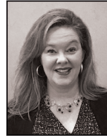
Special to Wesson News

With the number of Americans aged 65 and older expected to reach 13.8 million in 2059, Alzheimer's, which is the sixth leading cause of death in the United States and the fifth leading cause of death in those aged 65 and older, is a growing health crisis. One in ten people over the age of 65 have Alzheimer's disease, while more than 200,000 under the age of 65 have been diagnosed with this disease. More than 5.8 million Americans are living with Alzheimer's. Two-thirds of them are women, and it is estimated that women in their 60s are twice as likely to develop Alzheimer's over the rest of their lives. Deaths from