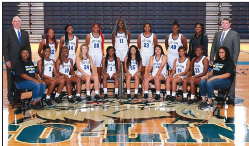
Lady Wolves basketball team.