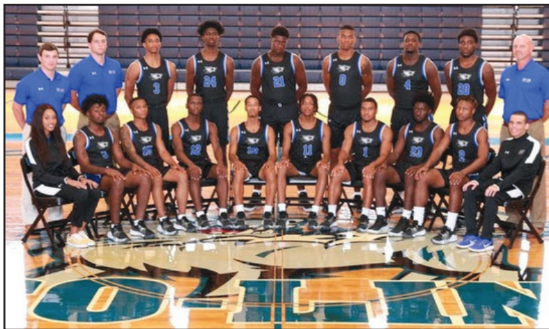
Wolves men's basketball team.