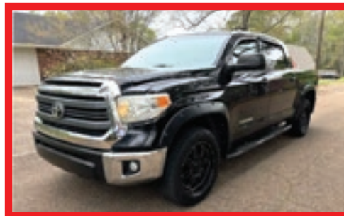
2014 Toyota Tundra Crewmax Low Mileage, v8, TSS Off Road, Rear Camera, Super Sharp!