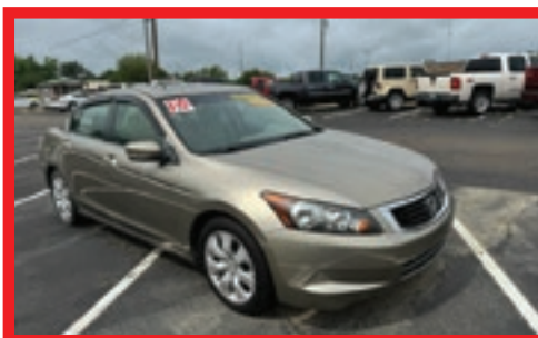
2010 Honda Accord EX-L Low mileage, Sunroof, Leather, High gas mileage