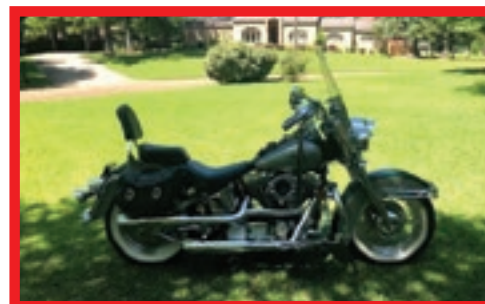
1996 Harley Davidson Heritage Softail only 1800 miles, many many custom parts, garage kept, like new