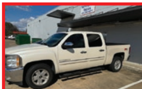
2012 Chev Silverado 4 door 4x4, Leather Buckets, Low mileage, Bed liner