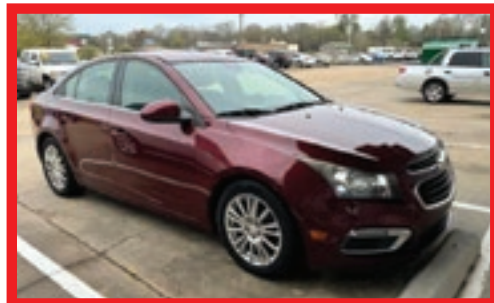
2016 Chev Cruze Limited Low Low Mileage, navigation, rear camera