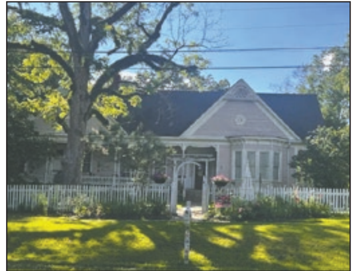
May special design award recognized McSweyn landscaping.