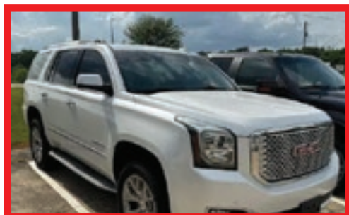
2016 GMC Denali Low mileage, Like New, Loaded