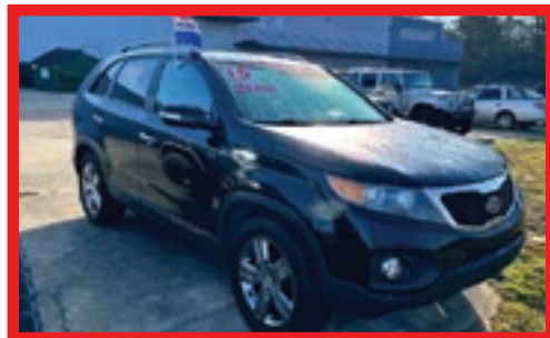
2013 Kia Sorento EX Low mileage, Sunroof, leather, rare third row seating