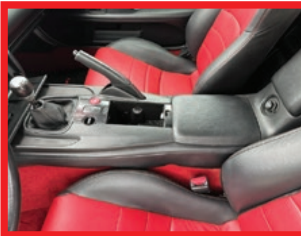
2008 Honda S2000 6-Speed MT - Only 57,000 original miles!!!