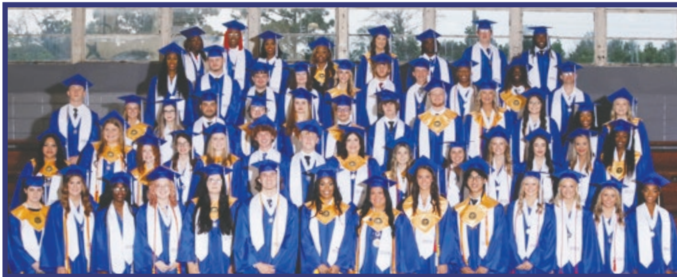
Special to Wesson News